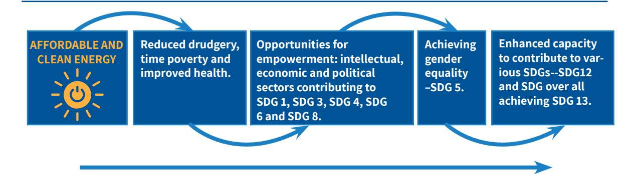
Figure 2: Affordable and Clean Energy Impact Pathway in Achieving Gender Equality and Climate Resilience

With SDG 7 as the means, the pathway for achieving women's empowerment and added contribution to other SDGs<sup>3</sup> is presented in Figure 2.