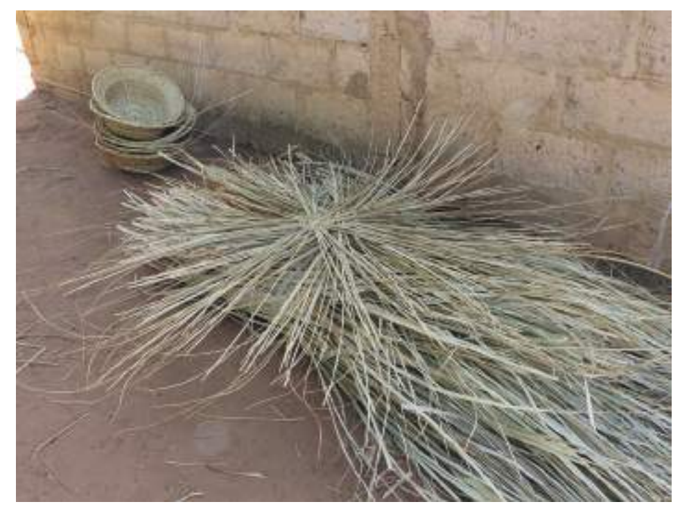
Palm tree material from a 'Farmer Managed Natural Regeneration (FMNR)' plot is used to weave baskets, Senegal.