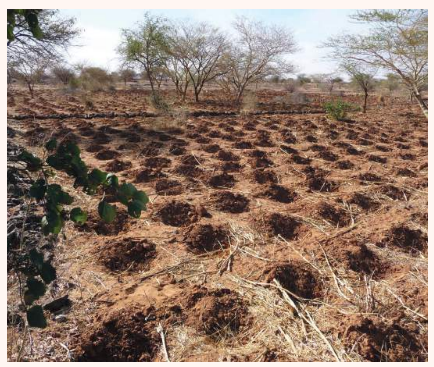
Traditional land restoration technique in Niger.

The Enhanced Direct Access (EDA) modality is one of the distinctive features of the GCF. It enables national entities to make independent funding decisions and has the potential to devolve funding and decision-making to the local level. Unfortunately, the modality is still only a small pilot