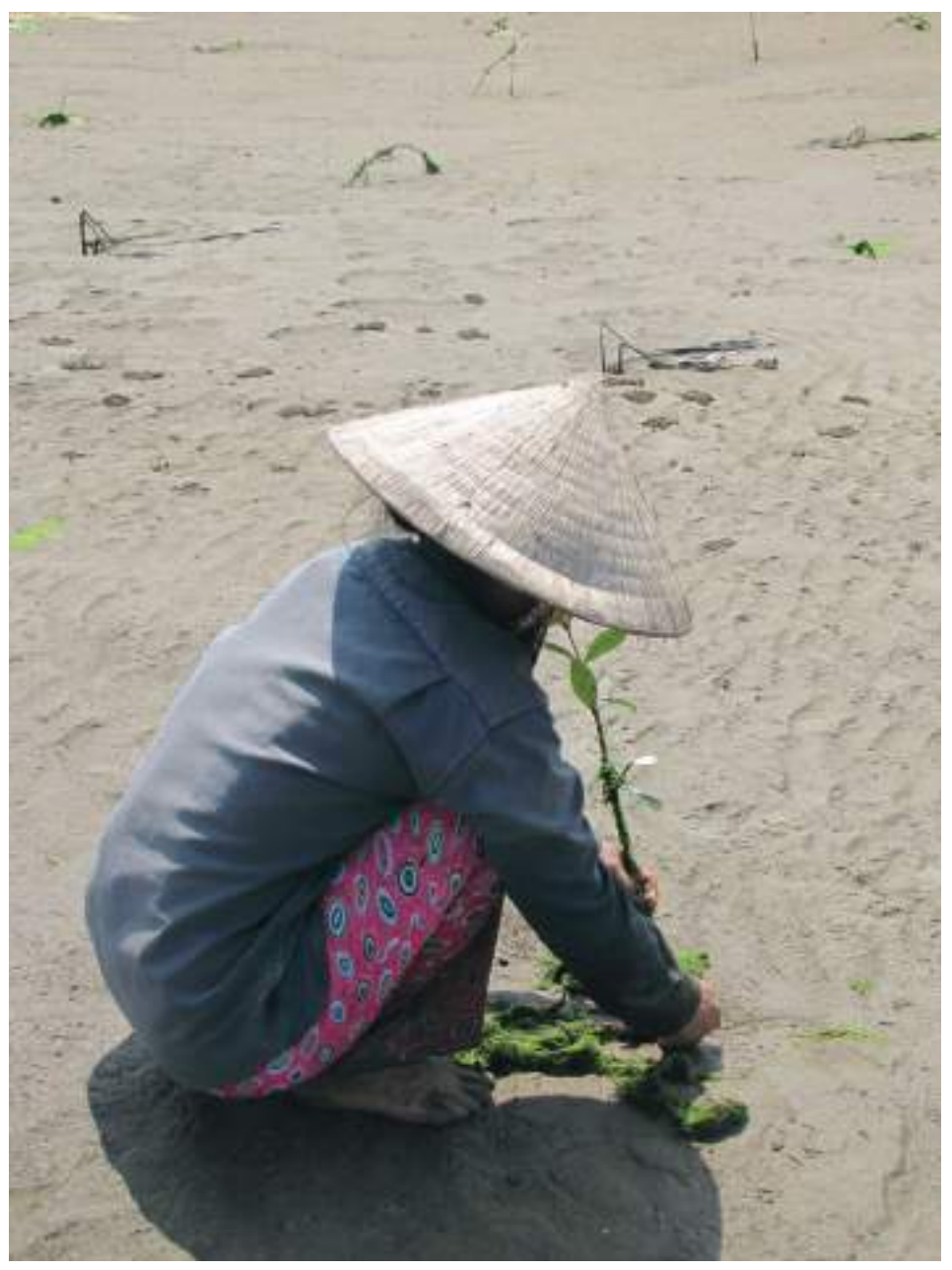
Woman planting mangrove trees to act as a buffer against sea level rise, Vietnam.

As a consequence they don't [even] know where to file a complaint.' She thinks affected communities and local CSOs may have difficulties finding their way to the IRM, as they do with other accountability mechanisms. Depending on the level of knowledge of the IRM at national, regional, and local levels, there may be a need for more information and support from international NGOs, among others.