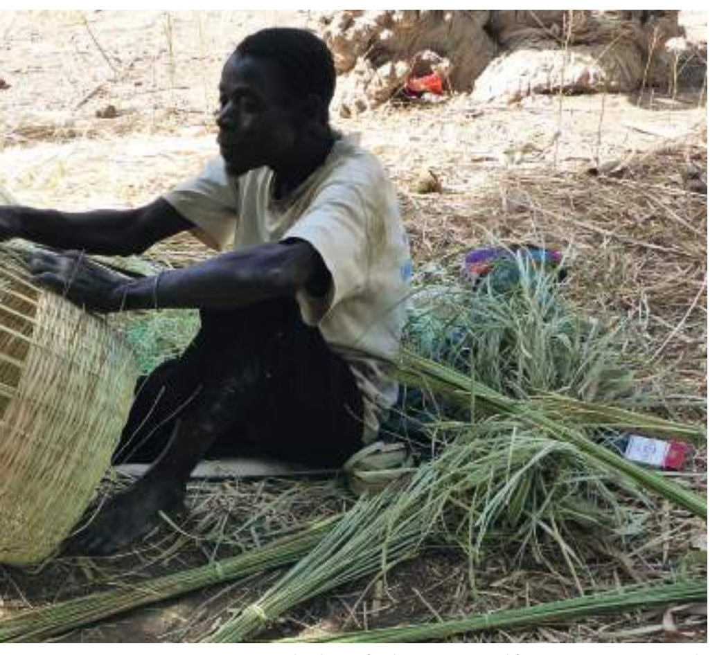
Weaving baskets of palm tree material from a 'Farmer Managed Natural Regeneration (FMNR)' plot, Senegal.

Meanwhile, large international entities need to be encouraged to channel some of their GCF funds in smaller amounts, and include local outreach and capacity building in their projects. As Liane Schalatek points out, 'International entities could set up nationally or locally managed small grants facilities as a routine subcomponent of their larger funding proposal.'