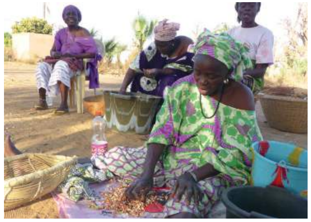
Women selling peanuts from a 'Farmer Managed Natural Regeneration' (FMNR) plot, Senegal.